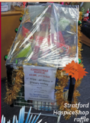
Stratford HospiceShop raffle

19 Borrell Ave, Westown BORRELL AVE WAREHOUSE Westown Donations – Drop offs Saturday 1pm-5pm Sunday 10am-5pm