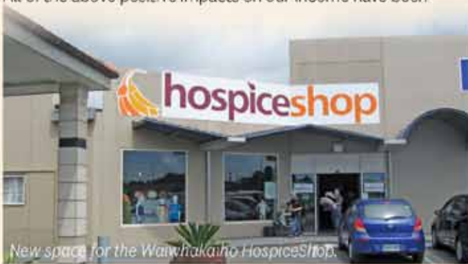
New space for the Waiwhakaiho HospiceShop.