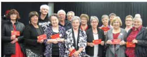
SPOT PRIZES DONATED BY ULTRAFAS FIBRE

This was a chance for our volunteers from all over Taranaki to join and be thanked for all the wonderful work they do for Hospice Taranaki. The volunteers that have been volunteering for 5 years, 10 years, 15 years and 20 years are recognised by everyone for the commitment they have made with a certificate and a badge that is proudly worn.