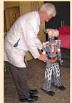
Photo: "Mad Scientist" & Robot.

Dolls - a very talented lady. Our annual in house Day Programme Auction was a great day, full of fun, humour and bargains for all. The year is not over yet and we have plenty still to look forward to with a Limousine Ride, a visit to the Christmas Shop, decorating the Lounge for Christmas and our end of year Community Christmas Lunch. We wish everyone in the community a safe and enjoyable Christmas with family and friends and look forward to seeing you New Year".