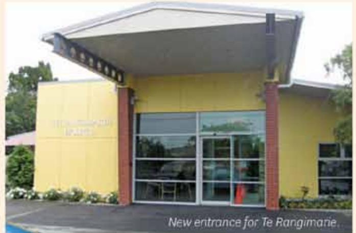
New entrance for Te Rangimarie.

All of the above positive impacts on our income have been