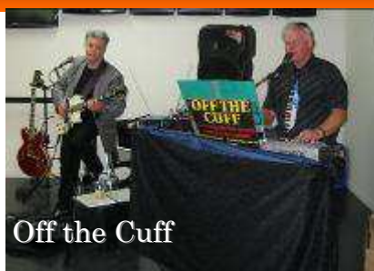
Off the Cuff