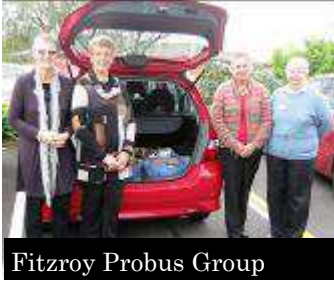
Fitzroy Probus Group