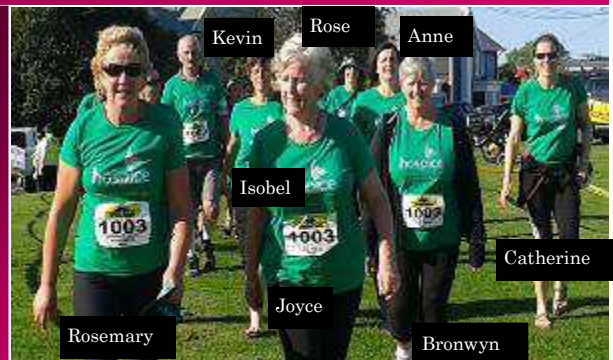
Hospice Hobblers—Staff of Hospice Taranaki competed in the Steelformers Around the Mountain relay — were thrilled with second place in their division. Fantastic fun