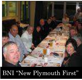
BNI "New Plymouth First"