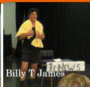
Billy T James